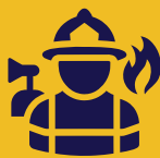
Seasonal Workers like Wildland Firefighters